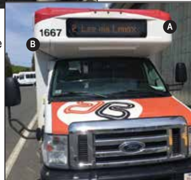
B. These four digits are the vehicle number. These numbers are only used to identify this specific BRTA vehicle within the fleet.