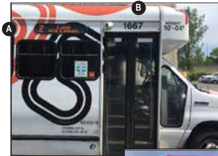
A. The headsign displays the route the vehicle is traveling. Buses not transporting customers display "Not in Service"

As the bus approaches you, be sure that it's the one you need before trying to board! The headsign message board above the front windshield will identify that bus' route number and final destination. BRTA fixed route buses are a variety of colors (green, yellow, or red) but never purple. Purple BRTA buses are only for ADA service clients, they will not stop when flagged by any other customers.